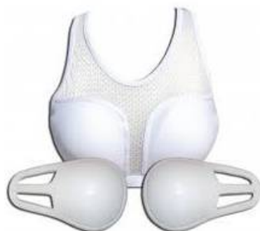
Homologated breast protection for women